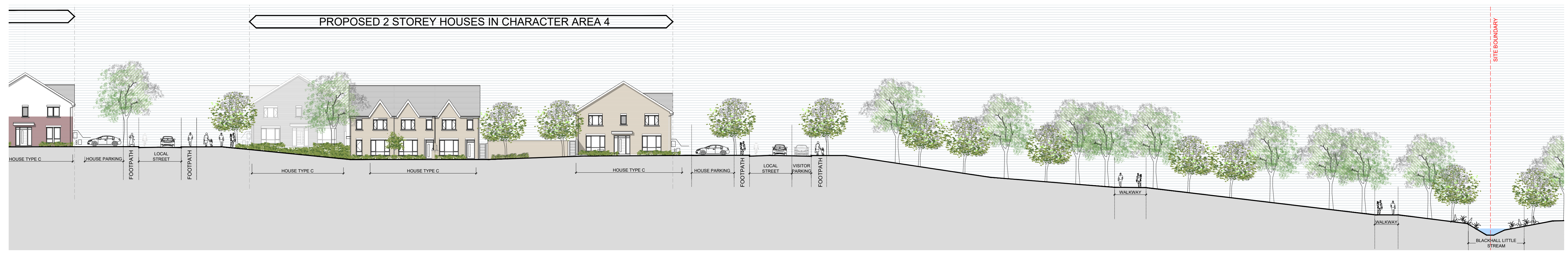
Site Section EE Continued