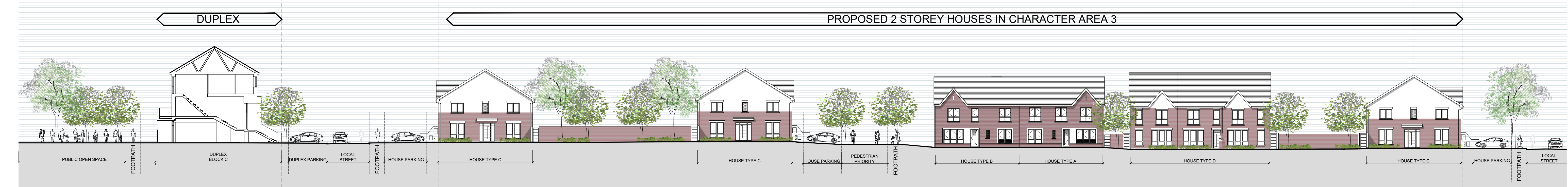
Site Section EE